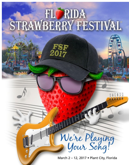
March 2 - 12, 2017 • Plant City, Florida